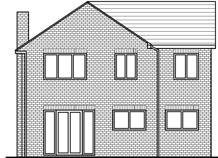
REAR ELEVATION AS EXISTING (1:100)