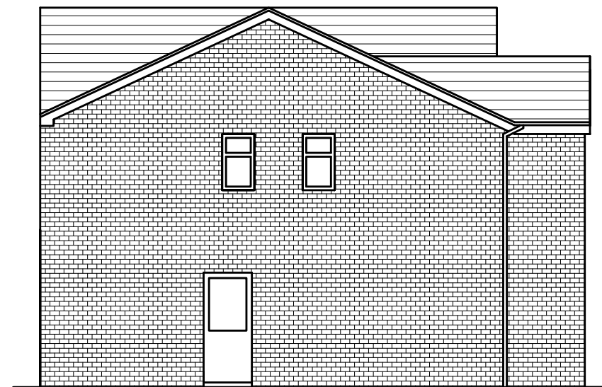
SIDE ELEVATION AS EXISTING (1:100)