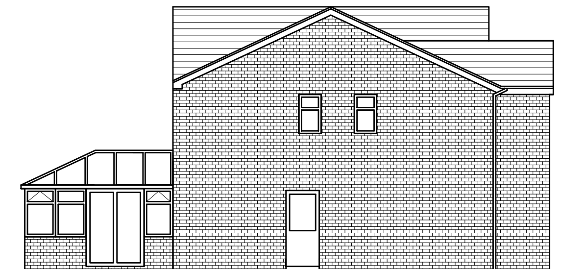
CONSERVATORY LEFT FLANK AS PROPOSED (1:100)