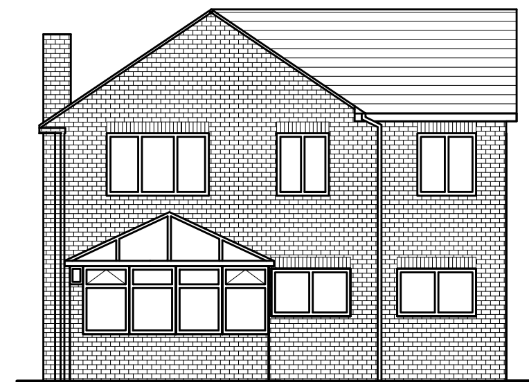
CONSERVATORY AS PROPOSED (1:100)