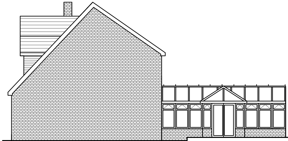
CONSERVATORY RIGHT FLANK AS PROPOSED (1:100)