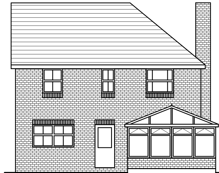
CONSERVATORY AS PROPOSED (1:100)