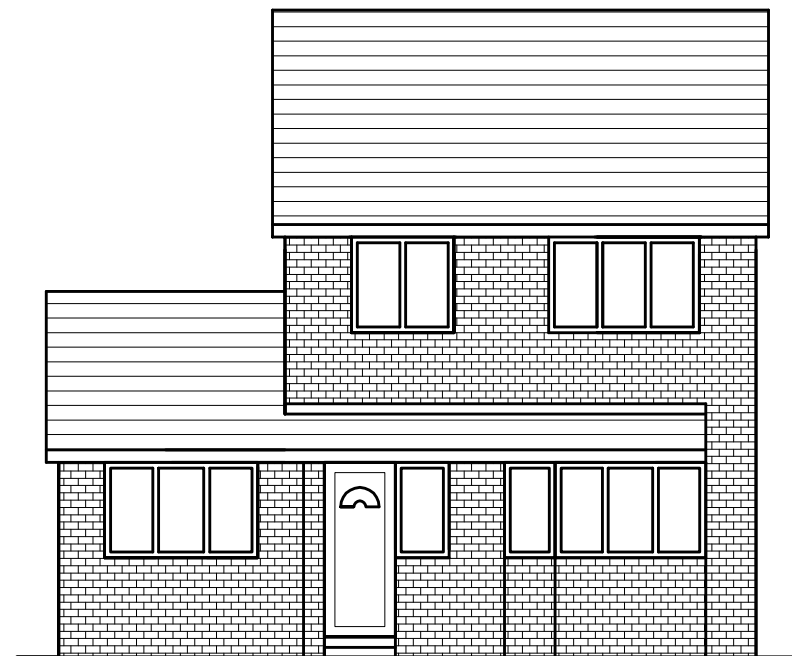
FRONT ELEVATION AS PROPOSED (1:100)