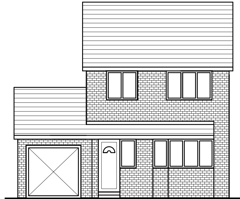
FRONT ELEVATION AS EXISTING (1:100)