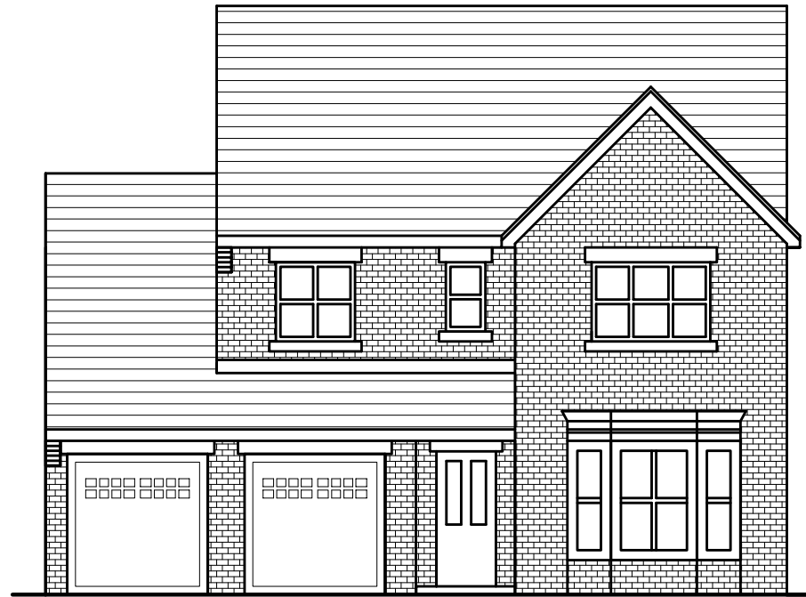
FRONT ELEVATION AS EXISTING (1:100)