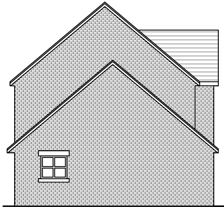
SIDE ELEVATION AS EXISTING (1:100)