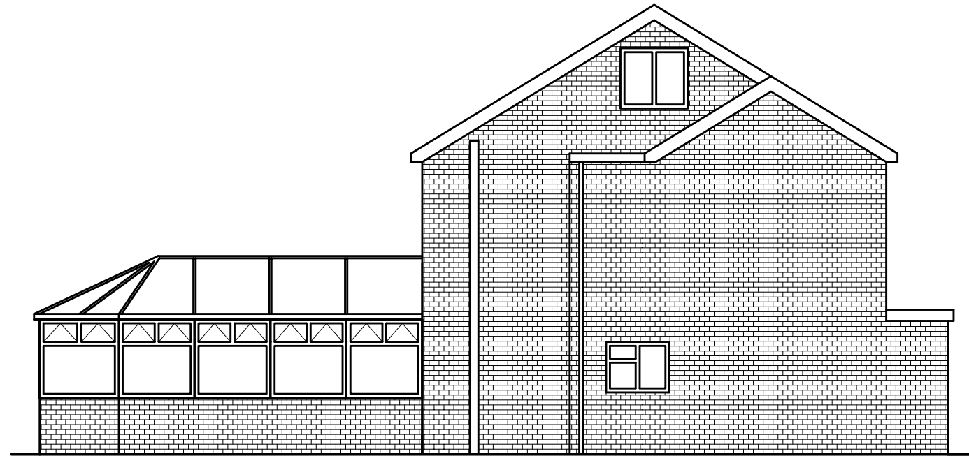
SIDE ELEVATION AS EXISTING (1:100)