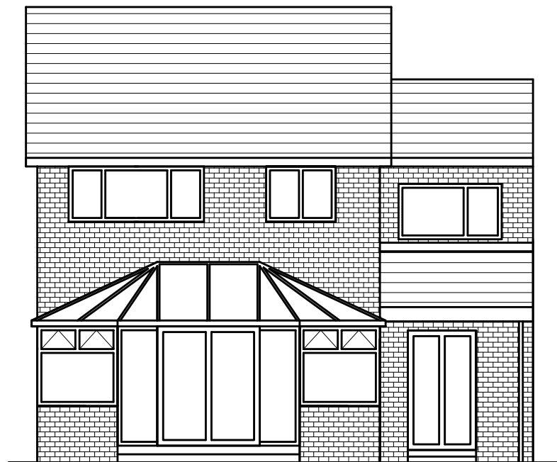
REAR ELEVATION AS PROPOSED (1:100)