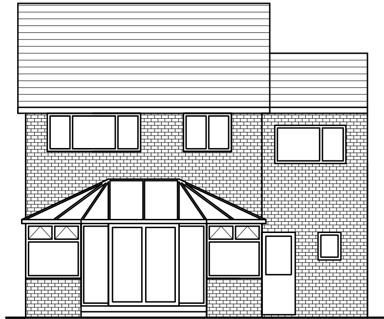
REAR ELEVATION AS EXISTING (1:100)